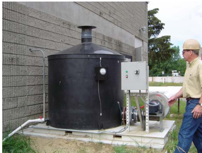
Wolverine Brand HDPE Adsorber

Our Model HDPE 39 is available as a stand alone Vessel or can come complete with Pressure Blower, Control Panel and a variety of Activated Carbons or Granular Potassium Permanganate to suit your particular air purification requirements. The Wolverine Brand HDPE 39 is available preassembled on an industrial skid or packaged as a kit for Onsite assembly.